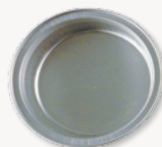
with MARTOL LVG 25 AQ

No staining and no residue, even at high temperatures.