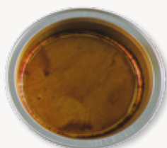
with standard vanishing oil